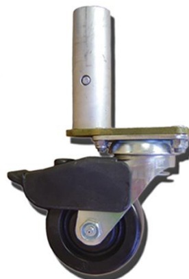
Single Rolling Leg with Sleeve