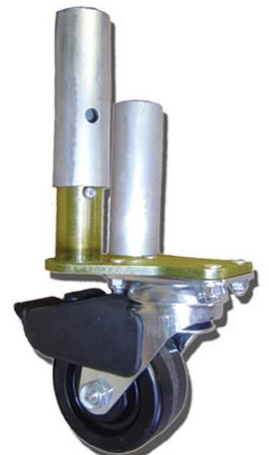
Double Rolling Leg with Sleeves