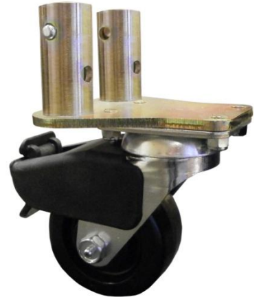
Double Rolling Leg

* *Rolling Riser Legs Require Sleeve For Use