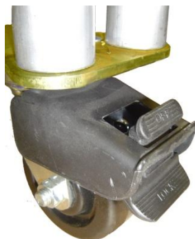
4" Total Lock Caster

Sleeves of the rolling leg insert into the corner extrusion of the underside of the stage deck. Then is tightened down with a thumbscrew.