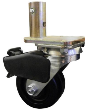
Single Rolling Leg