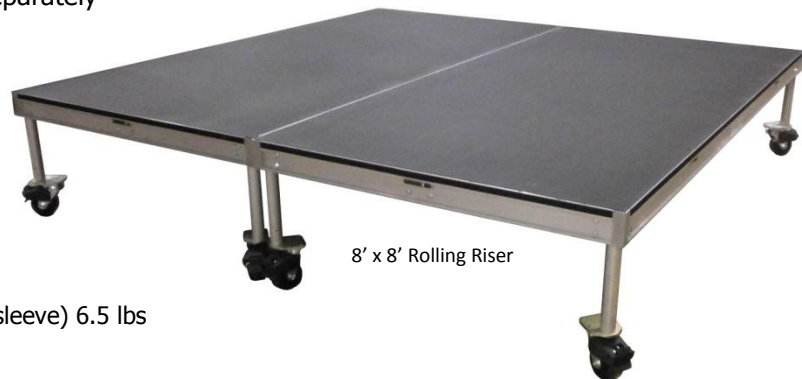
8' x 8' Rolling Riser

* *Rolling Riser Legs Require Sleeve For Use