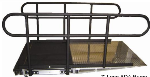
7' Long ADA Ramp