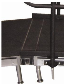
Transition Wedge- Side View