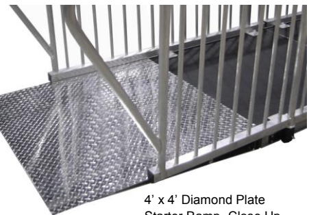
4' x 4' Diamond Plate Starter Ramp- Close Up