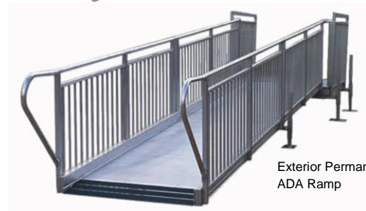
Exterior Permanent Install ADA Ramp