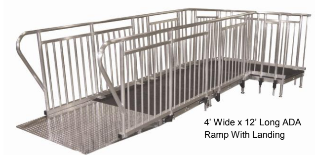
4' Wide x 12' Long ADA Ramp With Landing