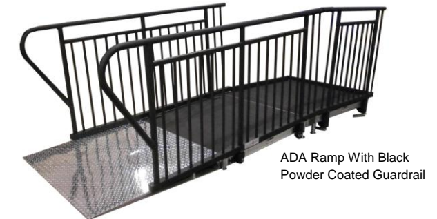
ADA Ramp With Black Powder Coated Guardrail